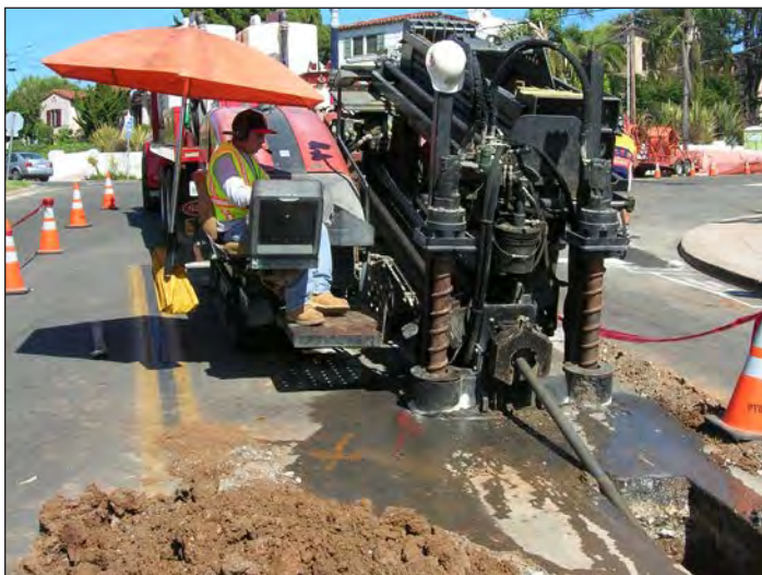
Along Presidio Drive, a contractor operates boring machinery which drills into the ground without leaving an open trench.

You have likely have seen trenching crews working in the streets. Trench work is approximately 80% complete in Project Block 2E. We ask for your patience as they complete this work, as it can be disruptive and distracting. Approximately two weeks prior to the start of the trench work on your property and in the street, you will receive a door hanger with the trenching contractor's name and phone number on it. If you have any questions or concerns about the work, please do not hesitate to contact the contractor.