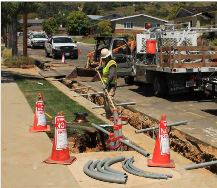
Construction crew member prepares to install conduit lines.

You have likely seen trenching crews working in the streets. Trench work is approximately 72% complete in Project Block 7CC. We ask for your patience as they complete this work, as it can be disruptive and distracting. Approximately two weeks prior to the start of the trench work on your property and in the street, you will receive a door hanger with the trenching contractor's name and phone number on it. If you have any questions or concerns about the work, please do not hesitate to contact the contractor.