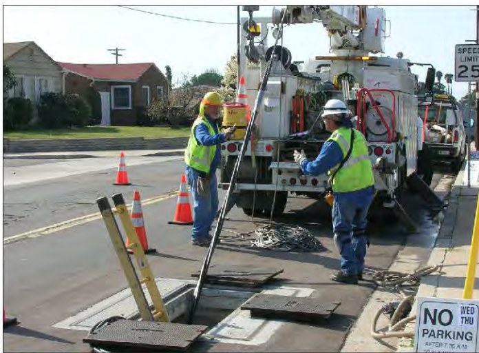
Crew members place SDG&E underground cables.

AT&T is 80% complete with cabling, 70% complete with customer cut-overs and 50% complete with overhead line removal activities.