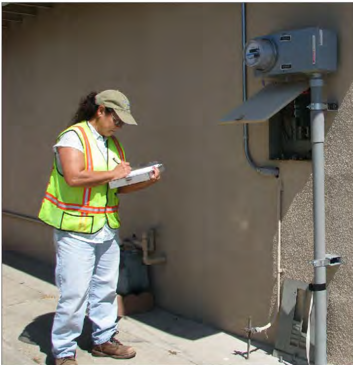
City of San Diego Inspector evaluates the electrical panel work and conduit installation.

SDG&E is 60% complete with cut-over activities.