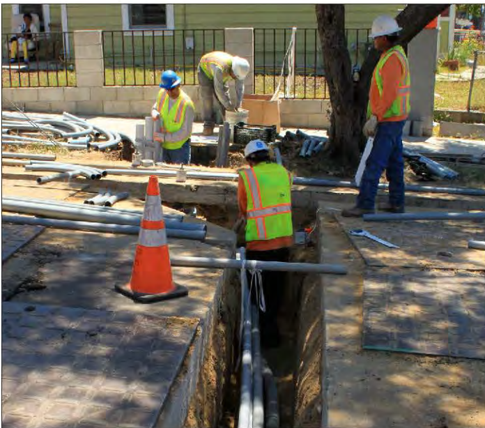
Construction crew members install conduit lines into prepared trench.

You have likely seen trenching crews working in the streets. Trench work is approximately 83% complete in Project Block 8G. We ask for your patience as they complete this work, as it can be disruptive and distracting. Approximately two weeks prior to the start of the trench work on your property and in the street, you will receive a door hanger with the trenching contractor's name and phone number on it. If you have any questions or concerns about the work, please do not hesitate to contact the contractor.