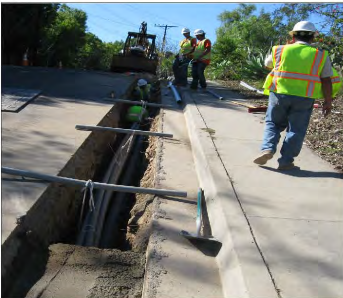
Construction crew members install conduit lines.

You have likely seen trenching crews working in the streets. Trench work is approximately 78% complete in Project Block 7CC. We ask for your patience as they complete this work, as it can be disruptive and distracting. Approximately two weeks prior to the start of the trench work on your property and in the street, you will receive a door hanger with the trenching contractor's name and phone number on it. If you have any questions or concerns about the work, please do not hesitate to contact the contractor.