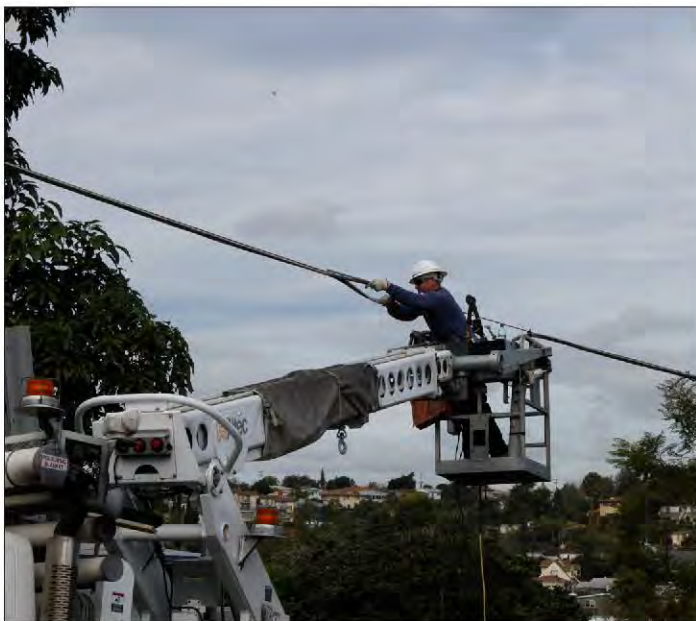
Crew member removes overhead utility lines.

AT&T is 80% complete with cabling, 70% complete with customer cut-overs and 50% complete with overhead line removal activities.