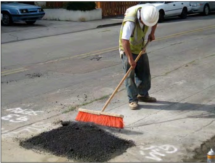
Crew member prepares asphalt to seal a trench cap.

Trench work is 95% complete in Project Block 2E/Mission Hills