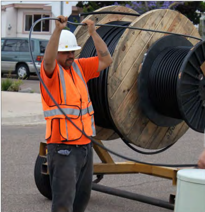
Crew member assists installing the utility cables.

After all trenching operations have been completed by our contractor, the cabling portion of the work will begin. Another contractor will perform the cabling work. Cabling involves technicians placing new utility lines in the new conduits, so that the new lines can be "energized" and brought into service. Once the new system has been energized, the process to "cut-over" customers from overhead to underground services will begin. Once customers have been cut-over, the overhead lines will be removed. We anticipate this process will move very swiftly and it's not nearly as disruptive or distracting as the trenching work, which is why you may not even see us working.