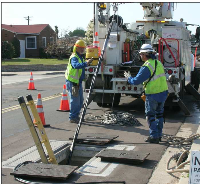
SDG&E crew members coordinate the installation of the utility cabling.

Trench work is 100% complete in Project Block 7CC.