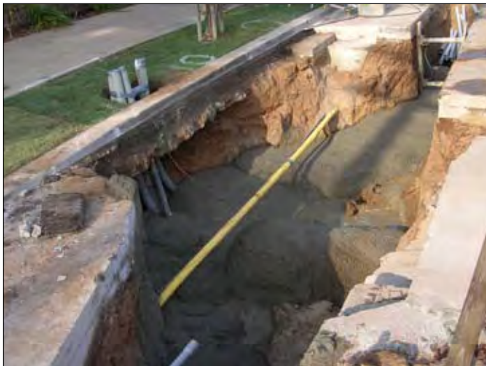
Conduit installation work on Witherby Street.

You have likely have seen trenching crews working in the streets. Trench work is approximately 85% complete in Project Block 2E. We ask for your patience as they complete this work, as it can be disruptive and distracting. Approximately two weeks prior to the start of the trench work on your property and in the street, you will receive a door hanger with the trenching contractor's name and phone number on it. If you have any questions or concerns about the work, please do not hesitate to contact the contractor.