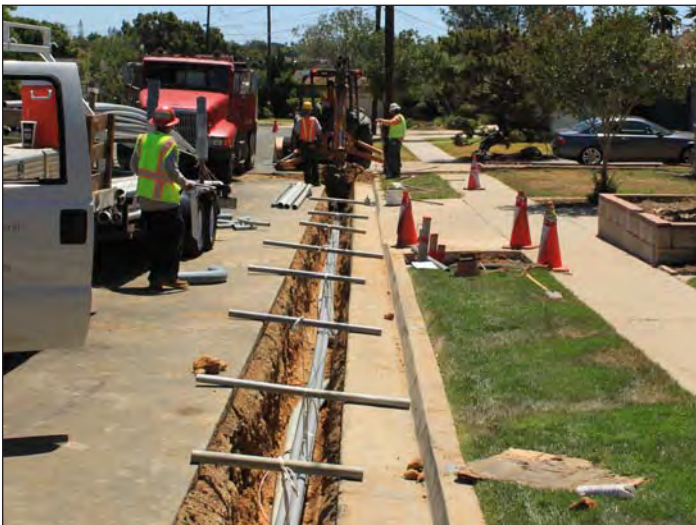
Construction crews install underground cables in a main-line trench.

You have likely have seen trenching crews working in the streets. Trench work is approximately 85% complete in Project Block 2E. We ask for your patience as they complete this work, as it can be disruptive and distracting. Approximately two weeks prior to the start of the trench work on your property and in the street, you will receive a door hanger with the trenching contractor's name and phone number on it. If you have any questions or concerns about the work, please do not hesitate to contact the contractor.