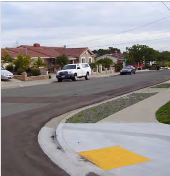
Newly completed trench work and pedestrian ramp.

SDG&E is 85% complete with cabling activities.