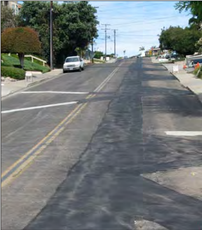
Completed trench work on the 3300 block of Garrison Street.

All panel and trenching work is complete. If you have any questions or concerns about the electrical or trenching work completed on your property, please do not hesitate to contact the contractor listed on the door hanger we left at your property.