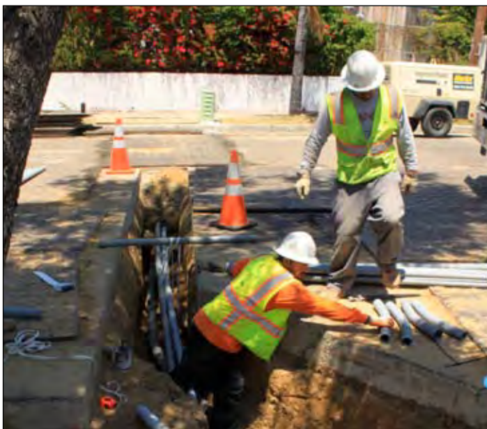
Construction crew members place new underground conduits in open trench.

We ask for your patience as they complete this work, as it can be disruptive and distracting. Approximately two weeks prior to the start of the trench work on your property and in the street, you will receive a door hanger with the trenching contractor's name and phone number on it. If you have any questions or concerns about the work, please do not hesitate to contact the contractor.