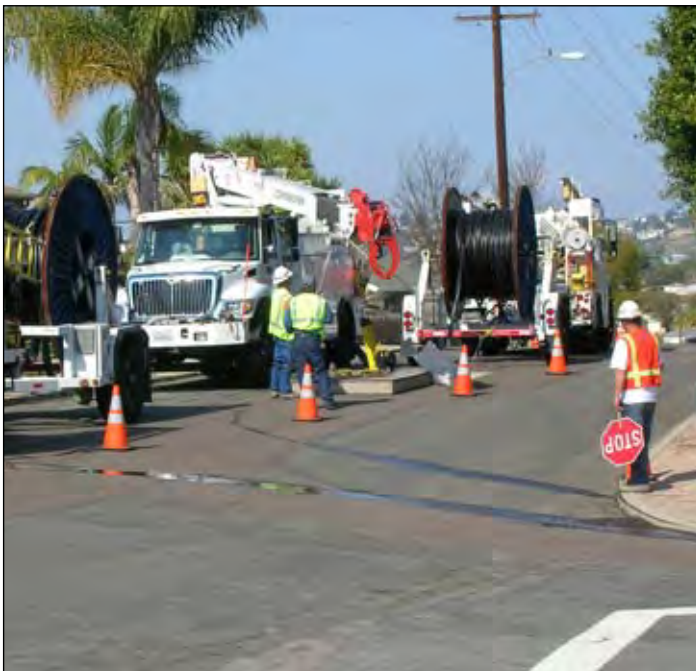
SDG&E cabling crew members works to install new underground utilities within the 1R/University City Project Block.

Both SDG&E and Time Warner Cable are 100% complete with cutting their customers over to the new underground system. Time Warner Cable began removal of their overhead lines. They are now 100% complete with this activity. Once the new system has been energized, the process to "cut-over" customers from overhead to underground services will begin. We anticipate the cabling and cutover phases will move very swiftly and they are not nearly as disruptive or distracting as the trenching work, which is why you may not even see us working. A door hanger will be left prior to the contractor visiting your property.