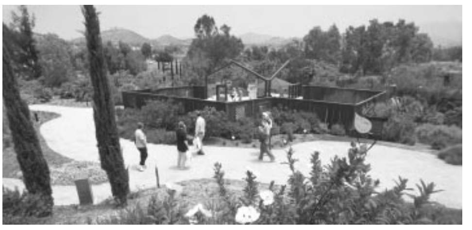
Visitors to the Water Conservation Garden learn that native plants don't have to be brown.