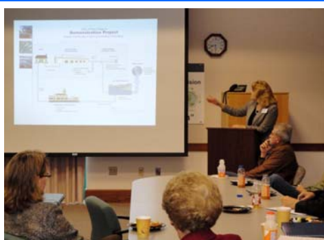
More than 100 groups throughout San Diego have invited the Demonstration Project speakers bureau to present to their members. To schedule a speaker for an organization's meeting, email purewatersd@sandiego.gov or call (619) 533-6638.