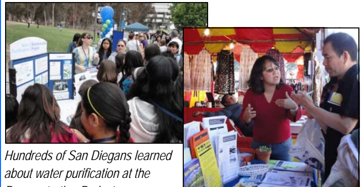
Hundreds of San Diegans learned about water purification at the Demonstration Project's informational booths at citywide community events. The City hosted exhibits at the San Diego Multicultural Festival, Earth Fair, Science Expo Day, Tet Festival, FilAmFest, and a dozen other events.