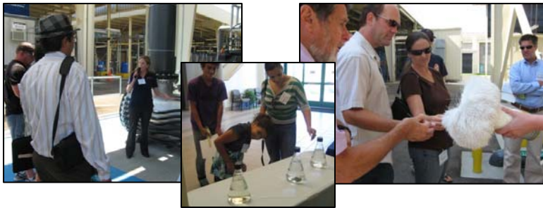
The Demonstration Project team has hosted more than 100 tours for over 1,500 people since the AWP Facility opened its doors. The facility has attracted San Diego residents, government leaders, and stakeholders from around the world.