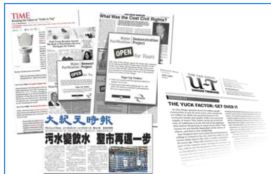
Many media outlets have covered stories on the Demonstration Project, including the Union-Tribune, USA Today, Huffington Post and TIME Magazine.