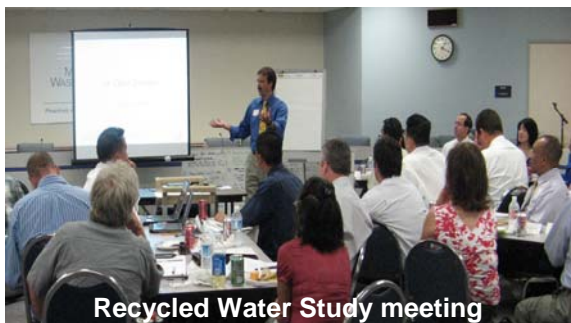
Recycled Water Study meeting