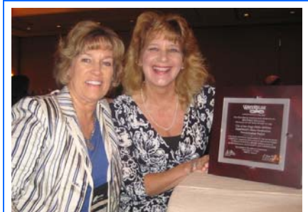
In September, the WateReuse Association honored the Demonstration Project with the 2011 WateReuse Association Public Education Program of the Year award.

Thank you to all who have taken the time to become informed and involved in this important project for San Diego's future.