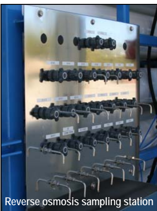
Reverse osmosis sampling station

In addition to monitoring water quality, each piece of equipment undergoes specific tests. For example, an automatic pressure decay test is performed daily on the membrane filters. This test is sensitive enough to detect even one broken fiber and helps confirm that more than 99.99 percent of all solid particles are consistently removed by the membranes. The integrity of the reverse osmosis is confirmed by continuous tracking of water quality levels before entering and after exiting the equipment. If the quality of the water produced by the reverse osmosis units were to decline, operators can test each individual pressure vessel to locate the membrane breach. At the ultraviolet disinfection/advanced oxidation stage, the amount of power being applied tells operators whether the lamps are functioning properly. Operators also measure the hydrogen peroxide dose rate to verify that the appropriate amount of hydrogen peroxide is used.