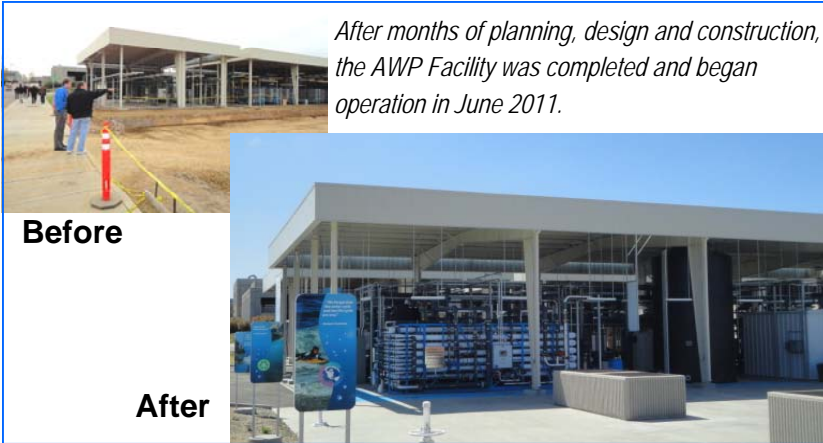
After months of planning, design and construction, the AWP Facility was completed and began operation in June 2011.

It has been an exciting and eventful year for the Water Purification Demonstration Project. In an effort to demonstrate that water purification can be a reliable, sustainable source of local water for San Diego, the project team strives to inform San Diegans about this important project. To this end, the project team reaches out to community members throughout the City by providing informational presentations, inviting residents to tour the Advanced Water Purification (AWP) Facility, and ensuring accessibility to information on the project website and social media platforms. The Demonstration Project and the AWP Facility have received positive feedback from project stakeholders in San Diego and internationally from Mexico, Vietnam, Australia, the United Kingdom, and Eurasian countries. Take a look at some of our 2011 highlights, including the unveiling of the state-of-the-art AWP Facility: