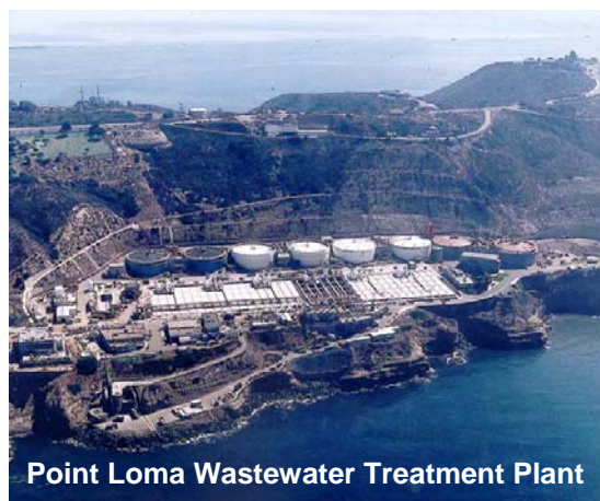
Point Loma Wastewater Treatment Plant

While the Long-Range Plan provides a foundation for water options for San Diego, other planning is continually taking place. The City's 2010 Urban Water Management Plan (UWMP) describes long-term resource planning responsibilities to ensure adequate water supplies are available to meet existing and future demands. For the UWMP, the City coordinated with SDCWA and with local water agencies and cities that receive water from the City. The 2010 UWMP assesses current demands, lays out supply expectations over a 20-year period, and details plans for various drought scenarios.