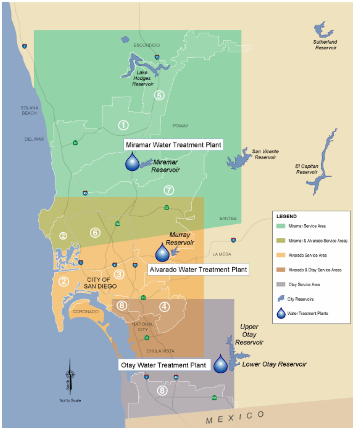
Figure 4-3 – Service areas for City of San Diego Water Treatment Plants (Circled numbers denote City Council Districts)