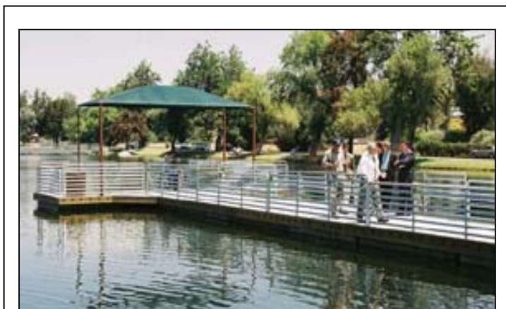
Padre Dam Municipal Water District – Santee Lakes Recreation Preserve uses recycled water.

The remaining non-potable uses of recycled water represent either a much smaller amount of overall reuse potential or an application difficult to implement in San Diego. In general, these opportunities include private residential landscape irrigation, wildlife habitat enhancement or wetlands creation, recreational impoundments (lakes or ponds), and other uncommon or specialized uses.