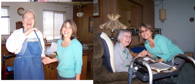
Lorie joined up with Meals on Wheels to deliver food to seniors throughout District 6.