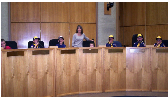
Cub Scout Troop 299 came to City Hall to learn a little more about local government. We may have a future councilmember in our midst.