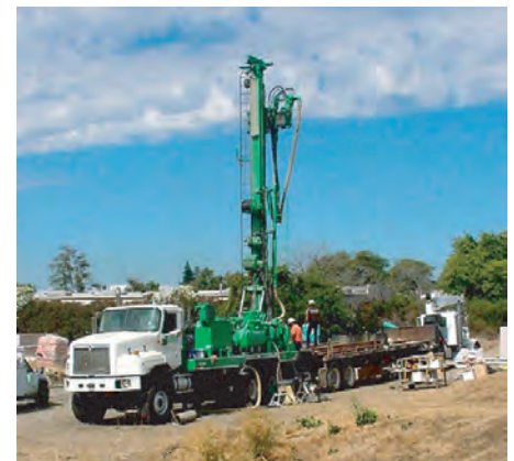
Figure 2. Typical drill rig used to construct a multiple-depth monitoring well.

USGS Project Chief, Wes Danskin , Research Hydrologist, 619-225-6132, wdanskin@usgs.gov, or refer to the project website, http://ca.water.usgs.gov/sandiego