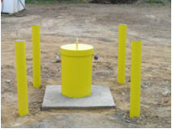
San Diego Formation Monitoring Well

A water resource strategy that includes conservation, recycled water, and groundwater supplies will help meet future water needs.