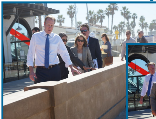
The Mayor and Councilmember Zapf review the newly constructed seawall.

The iconic Mission Beach Boardwalk is home to the first segment of the $4.5 million restoration project of the historic seawall. The wall is being constructed to be reminiscent of the original project constructed in the 1920s.