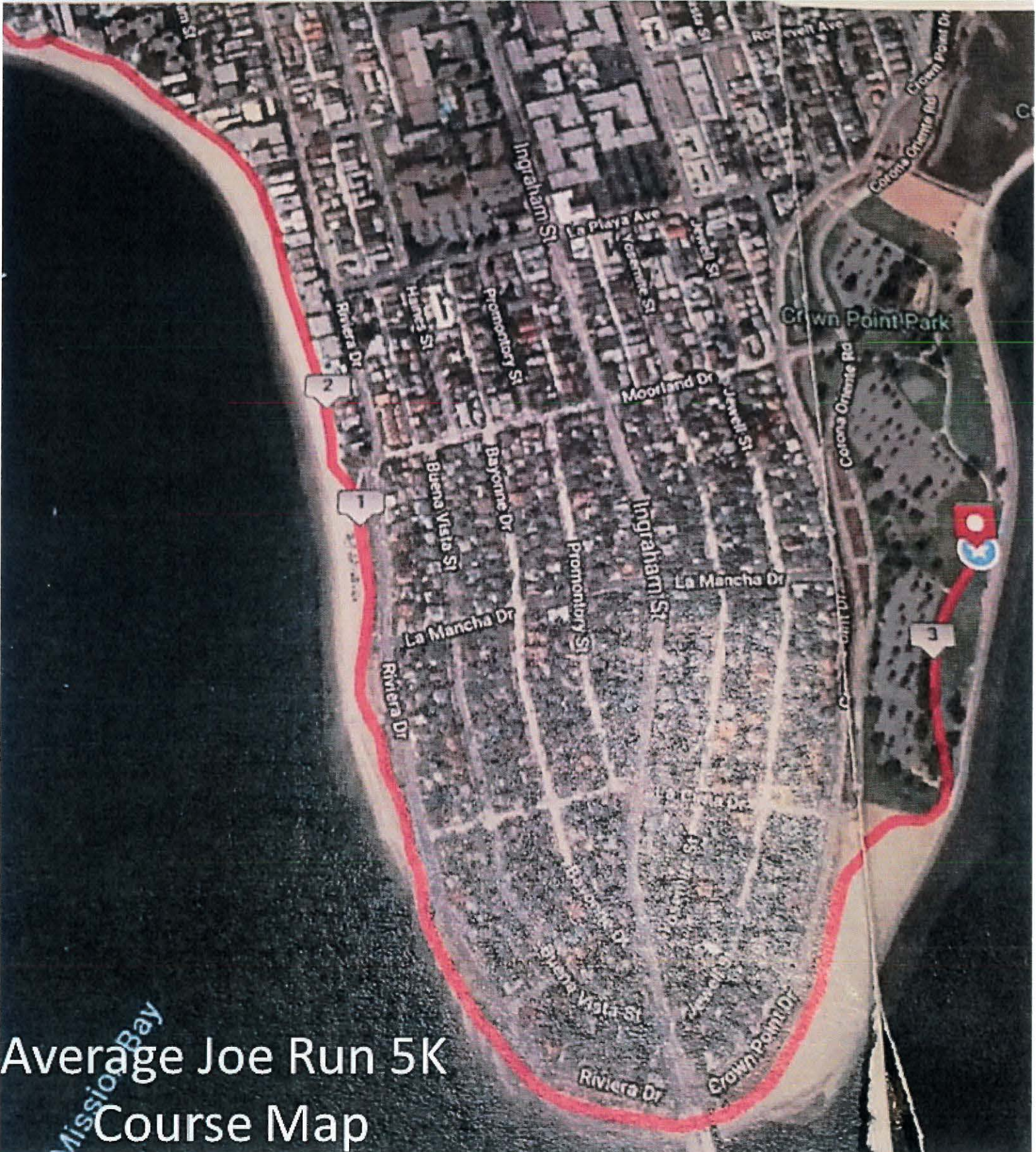
Average Joe Run 5K Course Map