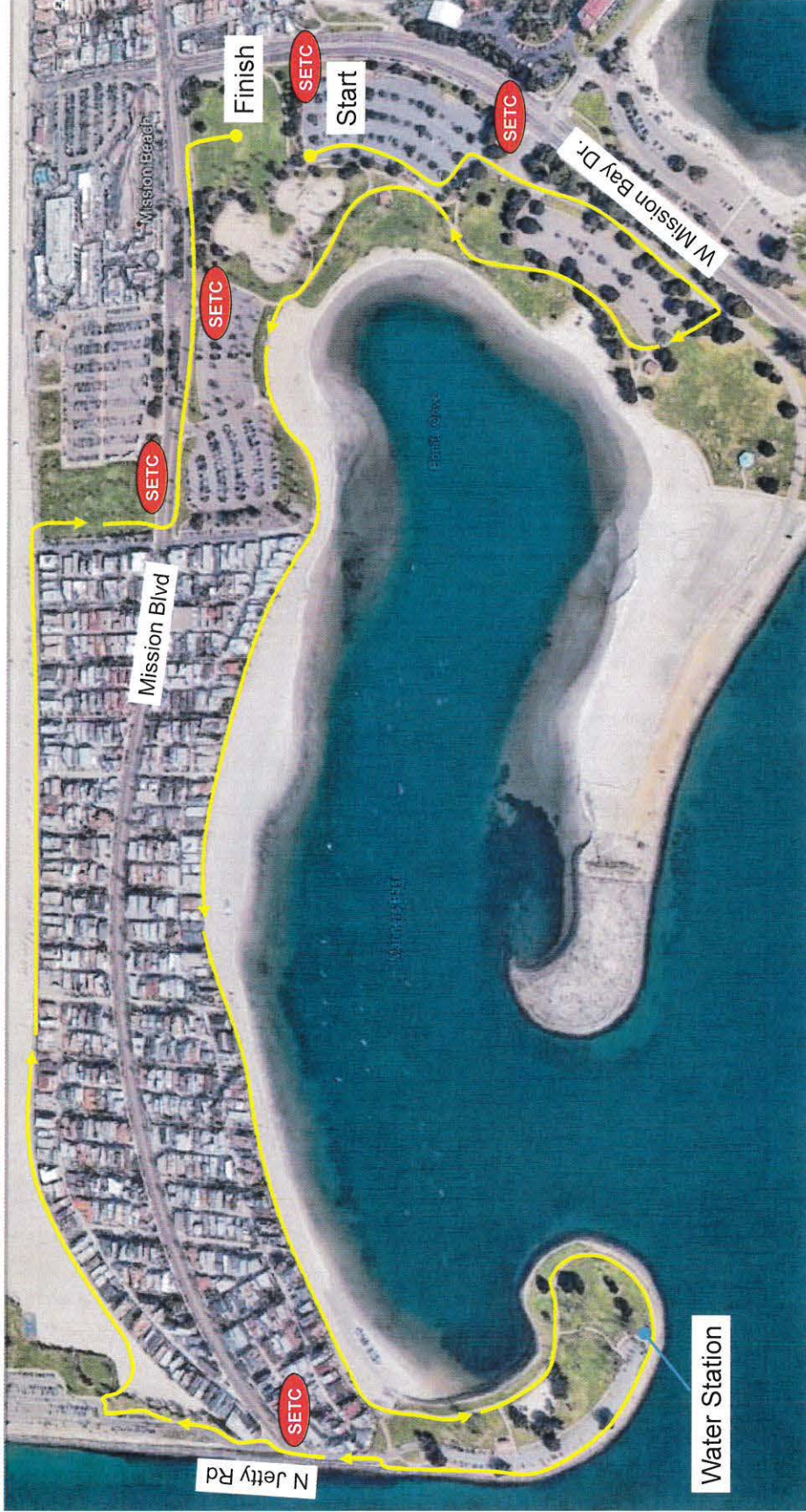
BALLAST POINT Beach & Brews 5K