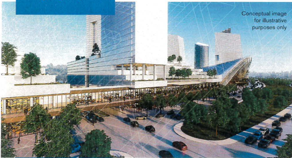
Conceptual image for illustrative purposes only