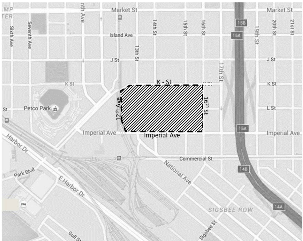
FIGURE A CONVENTION CENTER EXPANSION AND STADIUM PLANNED DISTRICT