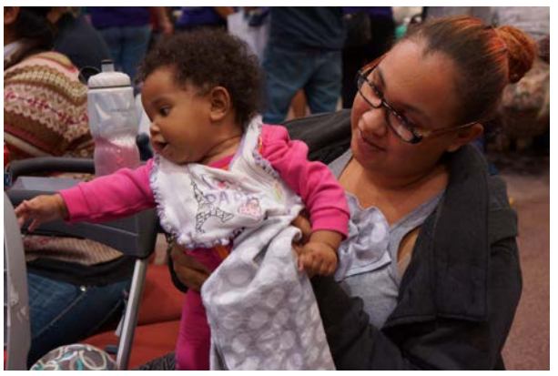
Project Homeless Connect – 1.28.15