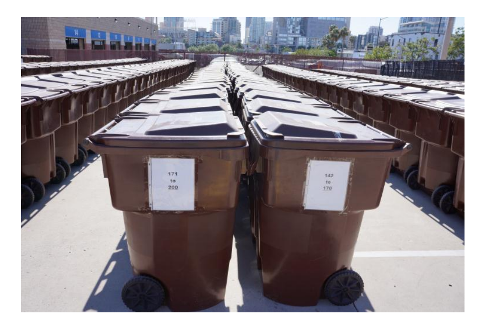
Storage Bins Homeless Transitional Storage Center at 252 16<sup>th</sup> Street