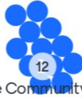
Doyle Community Park