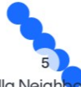
Villa La Jolla Neighborhood Park