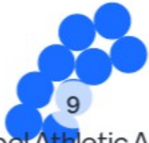
Nobel Athletic Area