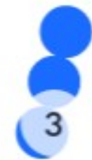
Eastgate Mini Parks