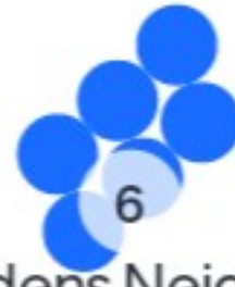
University Gardens Neighborhood Park