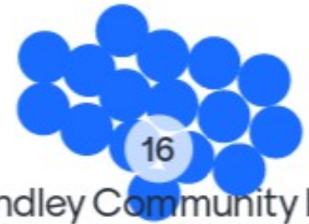
Standley Community Park