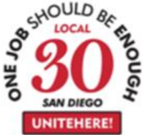
UNITE HERE LOCAL 30