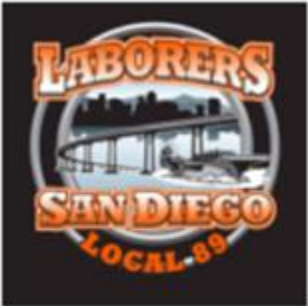
LABORERS INTERNATIONAL UNION, LOCAL 89