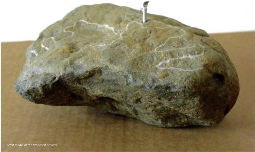
Artist model of the proposed artwork.