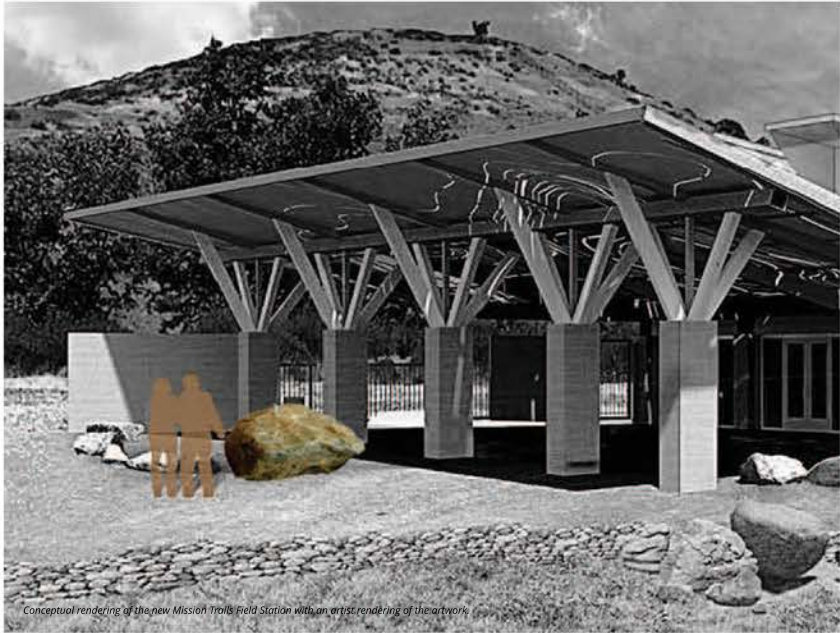
Conceptual rendering of the new Mission Trails Field Station with an artist rendering of the artwork.

The artwork will be located among other boulders in the field station’s outdoor gathering space adjacent to the covered picnic area. The sculpture will encourage a sense of discovery and contemplation in visitors as they study its carved trails and activate the drinking fountain.