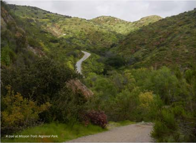
A trail at Mission Trails Regional Park.

The proposed artwork consists of a large granite boulder with trail-like channels carved into its surface. A functioning drinking fountain fixture rises out of the highest point of the boulder. When a curious park visitor activates the spigot, water flows through the array of tiny trails in serpentine paths down the slopes of the boulder.