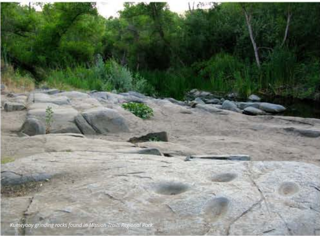
Kumeyaay grinding rocks found in Mission Trails Regional Park.

Inspired by both the park’s extensive trail system and archeological sites, the sculpture will be a simplified microcosm of the park that playfully celebrates some of its essential ingredients - water, stone, trails, and human energy. With this artwork, de Salvo aims to recreate the joy of finding and following trails on an intimate scale.