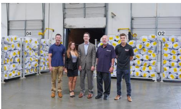
Thanking Jerome's Furniture & Absolute Exhibits for donating 200 beds and frames to Hurricane Harvey relief efforts