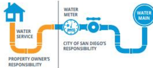
Figure 2: How To Locate Your Water Meter

Water and money are both precious resources. If you have questions about your water bill, rates and water conservation programs, visit the City's water and sewer customer information page or call my office for further assistance.