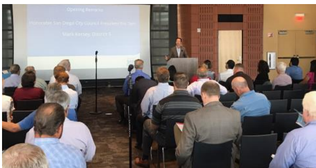
Welcoming contractors to the City's Pure Water San Diego and water/wastewater networking expo