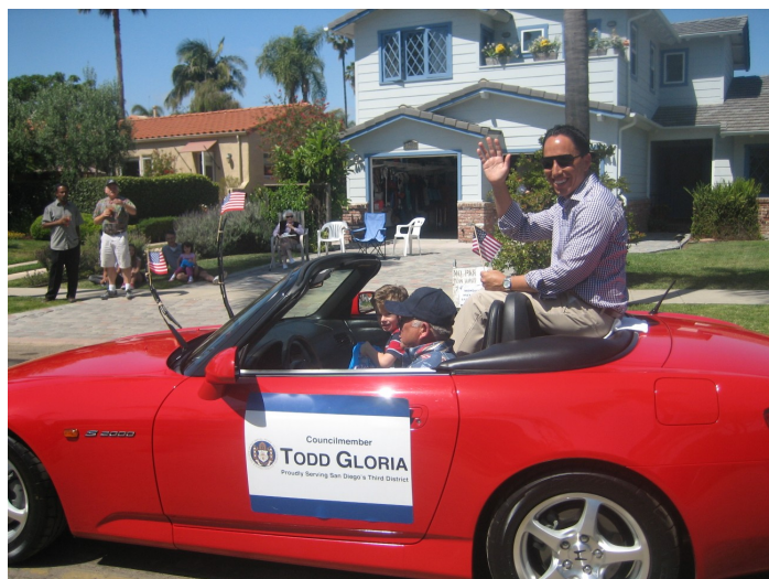
Memorial Day in District Three isn't complete without the parade in Kensington. Let summer begin!