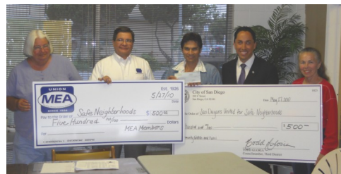
Councilmember Gloria with representatives from MEA and Safe Neighborhoods.

City Heights on Patrol and San Diegans United for Safe Neighborhoods are contributing greatly to the safety of Council District Three. Councilmember Todd Gloria showed his support for their efforts by allocating $500 from his district infrastructure funds to each organization in May.