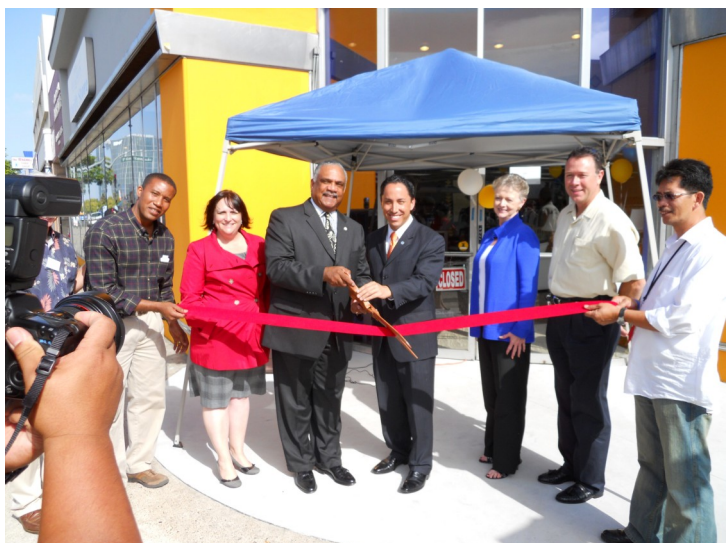
The San Diego Rescue Mission's remodeled thrift store opened on University Ave. in North Park on May 21.