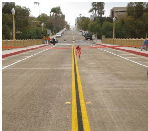
The renovated First Avenue bridge is again open to connect District Three neighborhoods with downtown.

The project's scope included: seismic retrofit, rehabilitation of the bridge deck, removal of existing lead paint, installation of historical street lighting, utility relocation where necessary, and repainting the entire bridge structure to its original color.