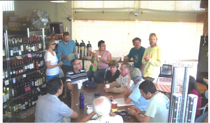
Neighbors share questions and concerns with the councilmember during a community coffee at Grant's Marketplace in South Park on August 14.