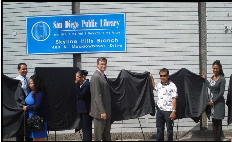
Photo Gallery | New Skyline Hills Library winning Design unveiling