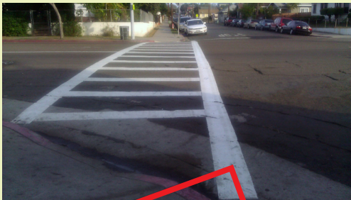
New crosswalk installed at 24th and Imperial

Councilmember Alvarez will continue to fight for much needed improvements and services to our neighborhoods. These improvements make our neighborhood cleaner and safer while bringing long overdue transformation to our district.