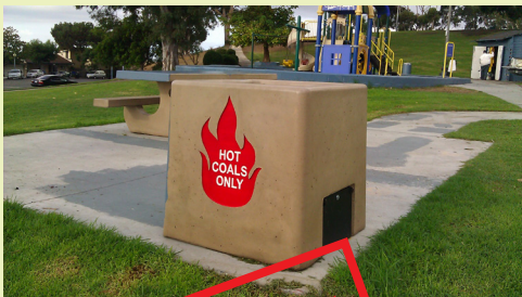
Hot coal depository and bench installed at Grant Hill Park.

The Mayor and City Council's support for this project is critical in utilizing local, clean, and reliable water sources. However, we can all do our part to make a difference. The Councilmember encourages you to take a tour of the Water Purification Demonstration Project to learn more about water reuse in our city. You can register online to visit the site at http://www.sandiego.gov/water/waterreuse/demo/ or by calling his office at (619) 236-6688.