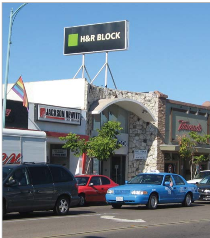
With the many streets that cross the community, roadway noise generated by motor vehicles is the primary source of noise within the community.

The General Plan identifies motor vehicle noise as a major contributor of noise within the City emanating from arterial roads, interstate freeways, and state highways. Higher levels of motor vehicle noise are generated primarily from the community's commercial corridors of University Avenue and El Cajon Boulevard, as well as Interstate-805. The General Plan allows residential uses along mixed-use corridors up to the 75 dB noise level, if sound attenuation measures are included to reduce the interior noise levels to 45 dB. Collector streets, such as 30th Street, Adams Avenue, and Upas Street, which provide traffic connections between commercial areas and single family neighborhoods located at the northern and southern ends of the community, have also raised a growing concern and need for attenuating motor vehicle traffic noise. The use of traffic calming measures to slow down traffic, increase pedestrian safety, and livability has been widely accepted in the community's residential neighborhoods. Reducing vehicular speeds for safety reasons also has the added benefit of reducing roadway noise associated with motor vehicles.