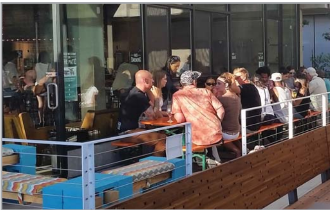
The increasing trend for eating and drinking establishments to incorporate "open air" concepts and outdoor patios has been a result of North Parks' favorable climate and unique street activity.