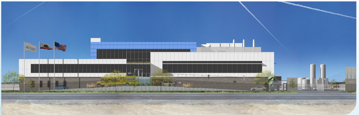
| Rendering of the North City Pure Water Facility and Pump Station

For more project information, please visit phase1.purewatersd.org or call 833-UTC-PWSD (833-882-7973) and a project team member will return your call within one business day. Please submit your email address via purewatersd.org or email purewatersd@sandiego.gov to be added to the distribution list for electronic notifications.