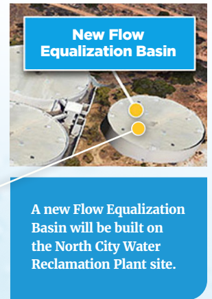
| Rendering of the North City Water Reclamation Plant Expansion and Flow Equalization Basin