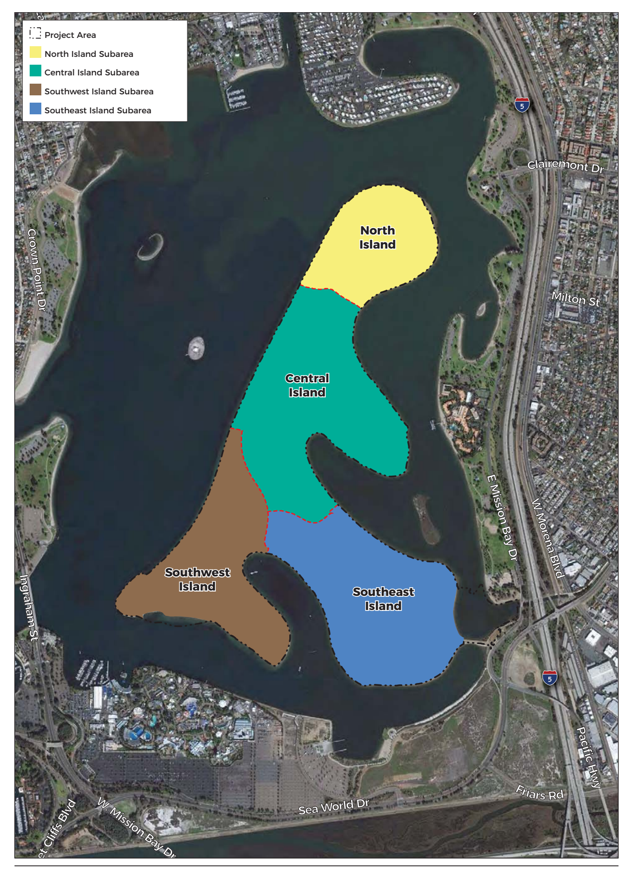
Figure 1 - Project Area