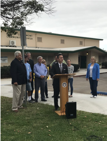
CLAIREMONT: In an action which would have erased nearly 40 years of history and volunteerism from our Recreation Councils , I asked my council colleagues to consider an alternative solution. I am pleased to report that due to the hard working volunteers of this City, we were successful in continuing the dialogue. The Council directed the item to be heard at the PS&LN Committee on December 6 th .