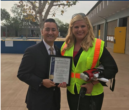
MIRA MESA: I took part in the Great California ShakeOut with 435 students at Hickman Elementary School .