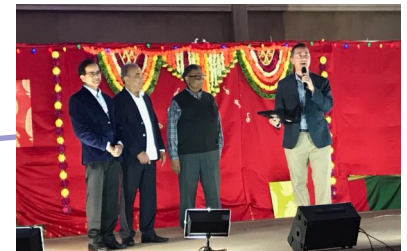
MIRAMAR: Thanks to ShriMandir for inviting me to take part in celebrating Diwali in Little India.