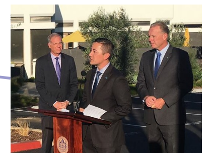
KEARNY MESA: I announced a Safe Parking Program for Homeless Individuals & Families Living Out of Their Cars. I believe D6 needs to be part of the solution that helps provide services to those individuals and families most in need.