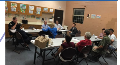
RANCHO PENASQUITOS: The NFC hosted their 2018 Strategic Planning Meeting & Open Forum at the Canyonside Recreation Center . Our office received close to 100 priorities and suggestions to include in our 2018 Strategic Plan.