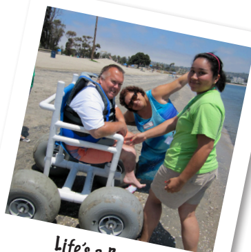
Life's a Beach!