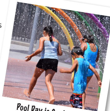
Pool Day is Cool Day!