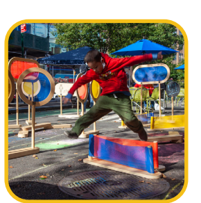
Quick to Implement