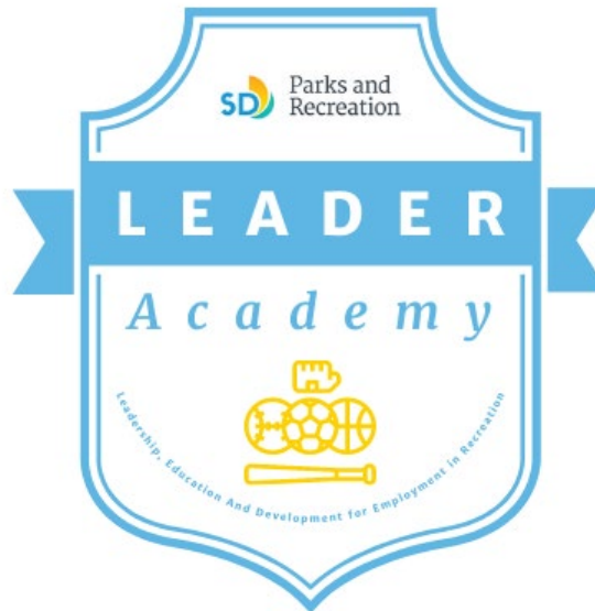
Back to Work SD