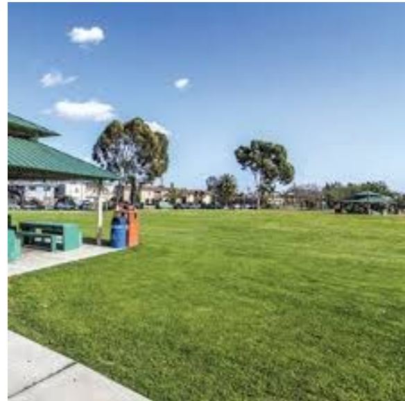
Park and Facility Use Permits