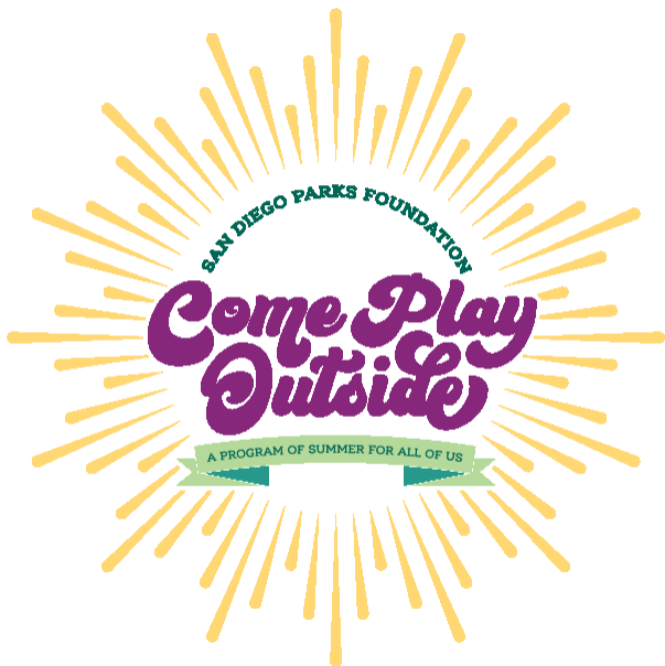
Come Play Outside