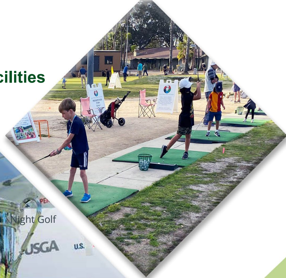
New Practice Facilities