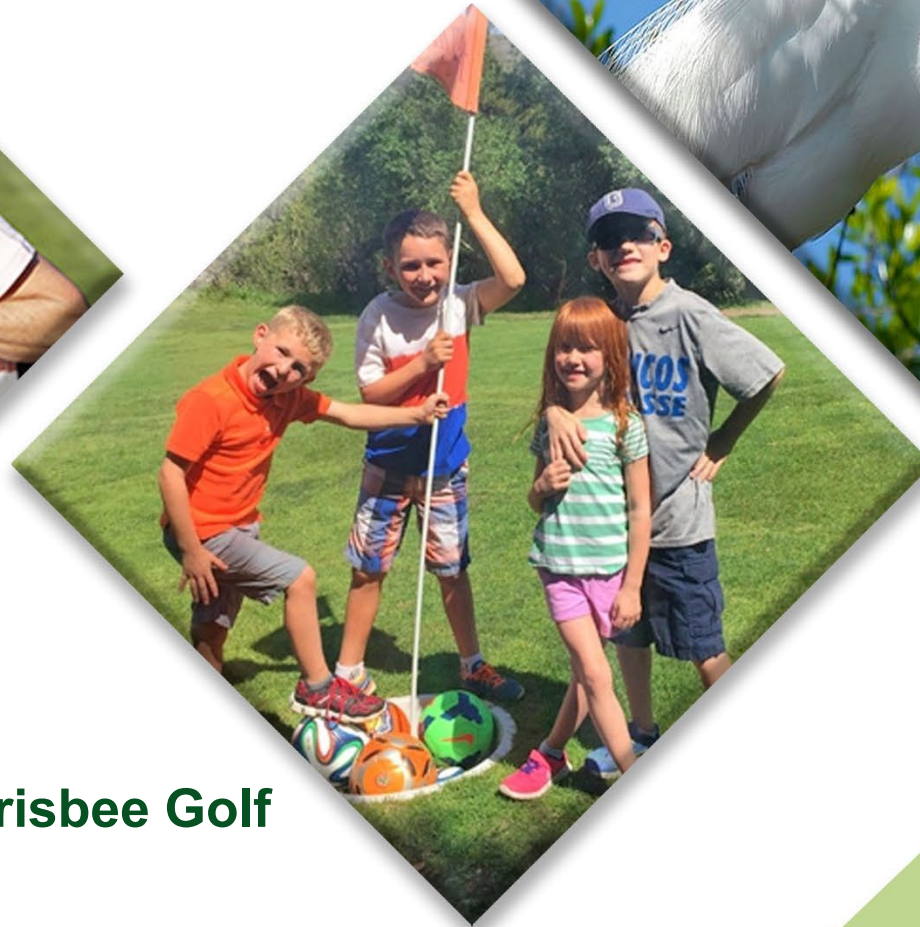
Foot and Frisbee Golf