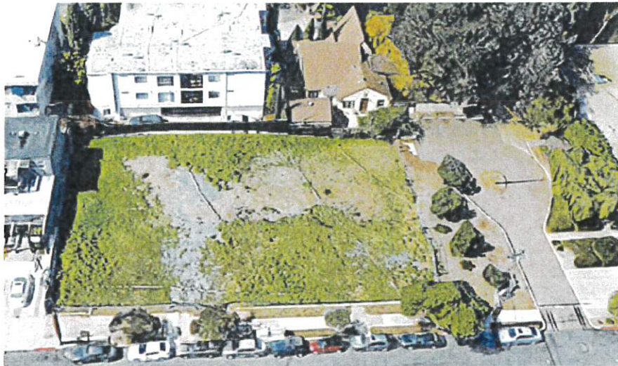
Aerial photo of Olive Street Park site at Olive Street and Third Avenue