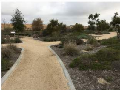
NATURAL OVERLOOK AREAS

denney ranch neighborhood park | public meeting