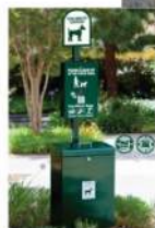
DOG WASTE STATION