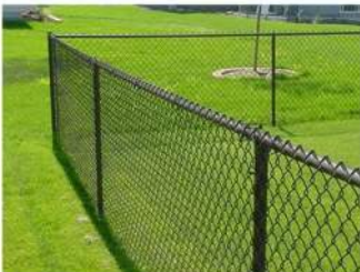
BLACK VINYL CHAIN LINK FENCE