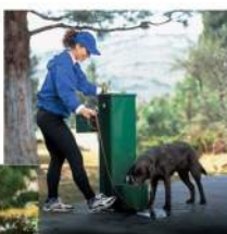
DOG WATER FOUNTAINS