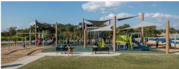
TOT LOTS 2-5 AND 6-12 WITH RUBBER PLAY SURFACE AND SHADE SAILS