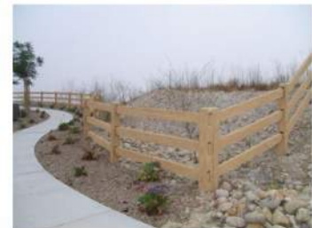
CONCRETE 3-RAIL FENCE