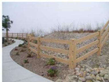
CONCRETE 3-RAIL FENCE