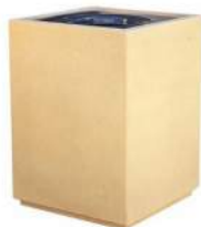
TRASH RECEPTICLE / MATCHING HOTCOAL RECEPTICLE