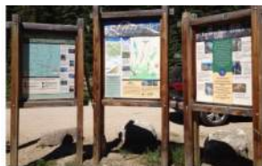
TRAIL HEAD SIGNAGE