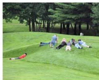
LOW EARTH MOUNDS