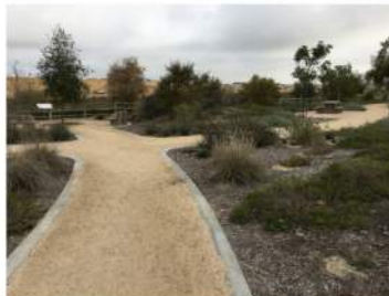
NATURAL OVERLOOK AREAS