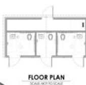
FLOOR PLAN SCALE: 1/8" = 1'-0"