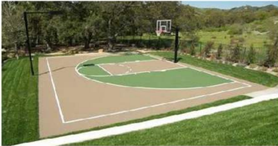
HALF COURT BASKETBALL

dennerly ranch neighborhood park | public meeting