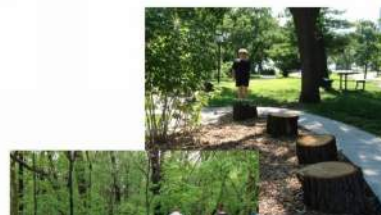
EXPLORATION TREE GROVES