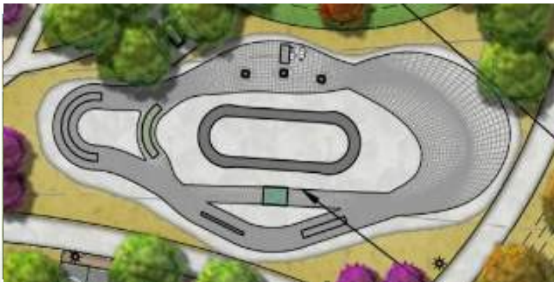
BICYCLE PLAYGROUND - CONCRETE PUMP TRACK CENTER RING WITH OUTER CONCRETE AGILITY COURSE RING - POTENTIAL COLORED CONCRETE

denney ranch neighborhood park | public meeting