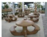
FOOD COURT TABLES