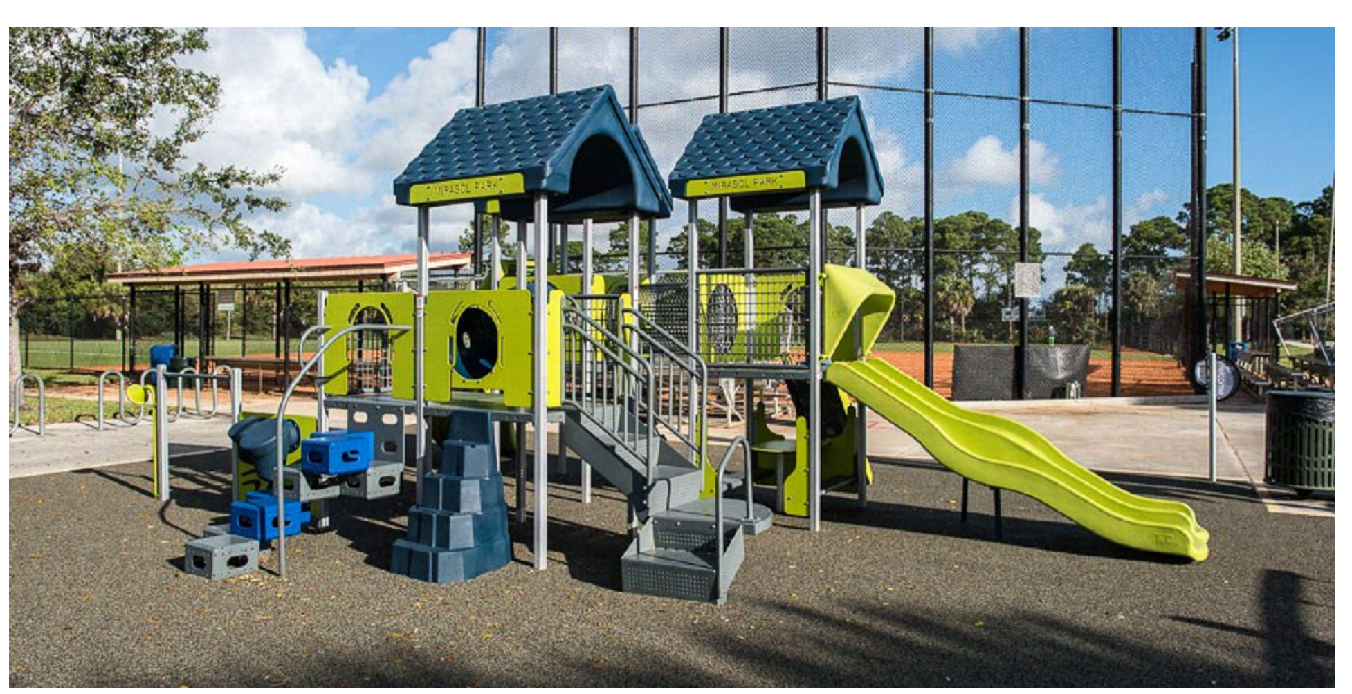
2-5 YEAR OLD PLAY EQUIPMENT