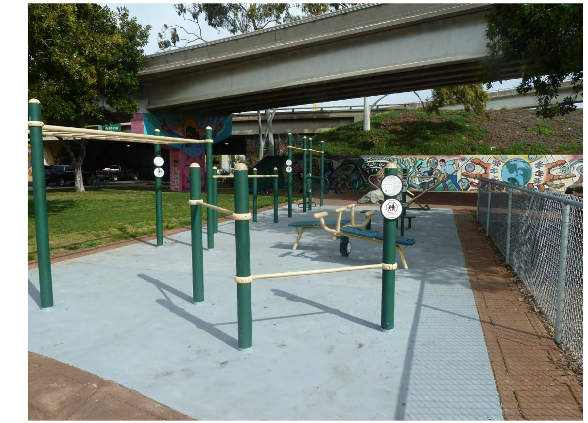
STATIC EXERCISE EQUIPMENT