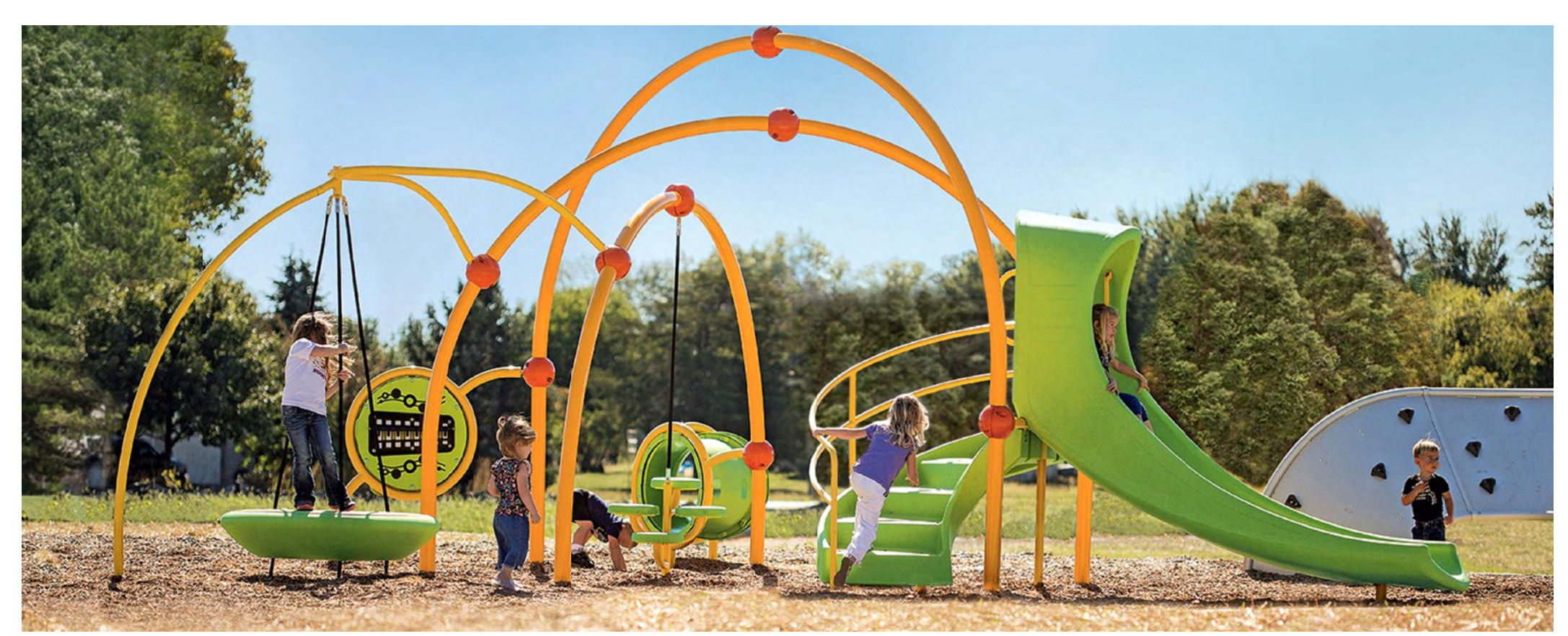
2-5 YEAR OLD PLAY EQUIPMENT