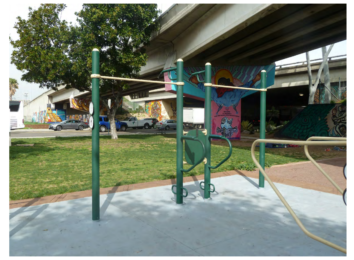
STATIC EXERCISE EQUIPMENT