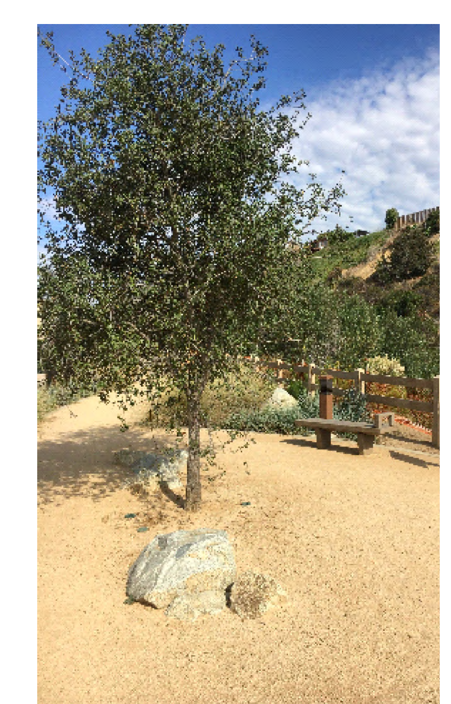
DECOMPOSED GRANITE PLAZA