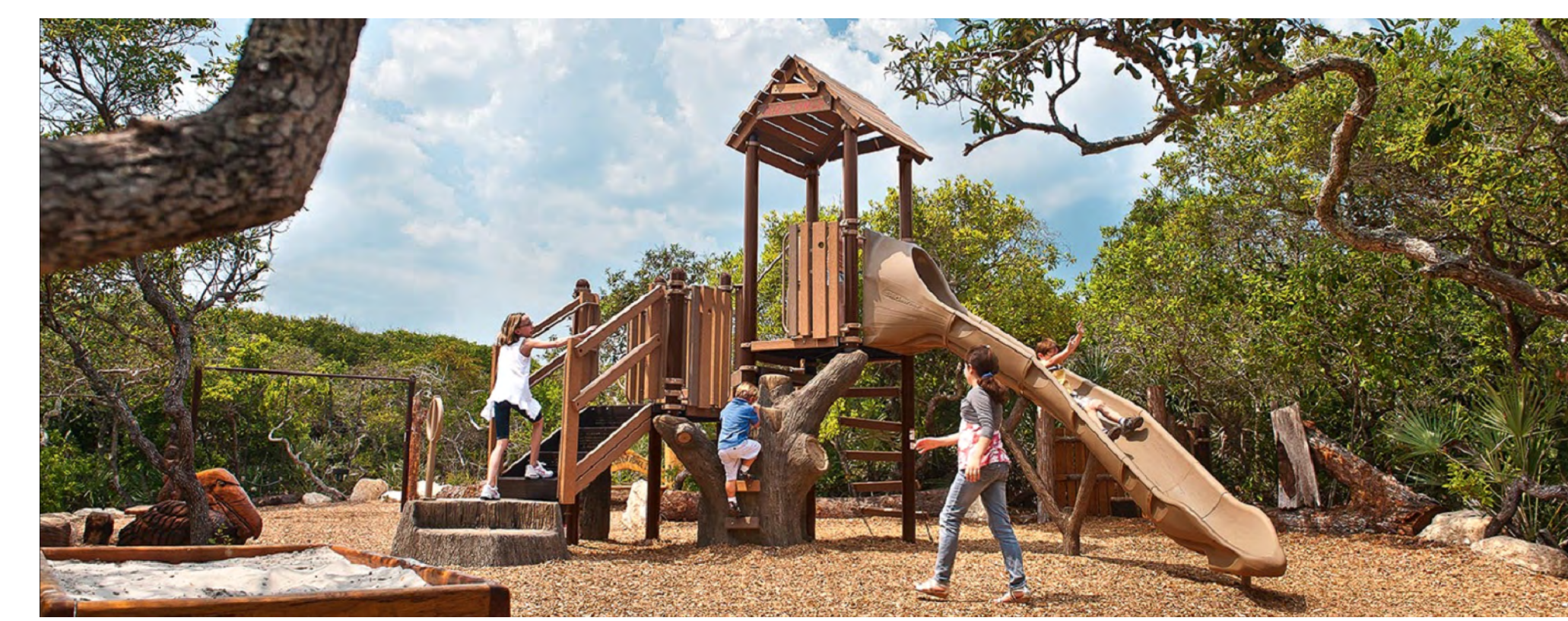
5-12 YEAR OLD PLAY EQUIPMENT