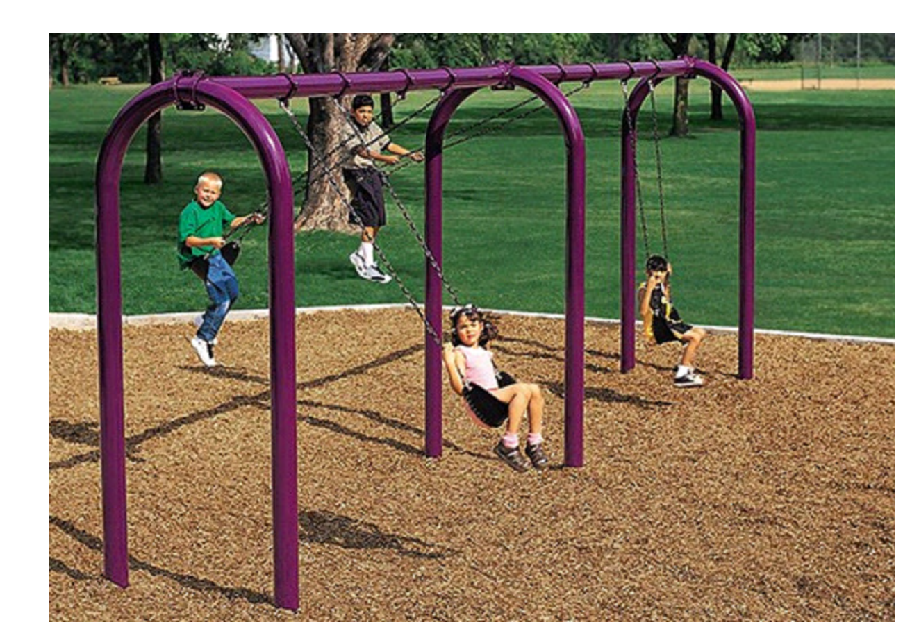
INDEPENDENT SWING SET