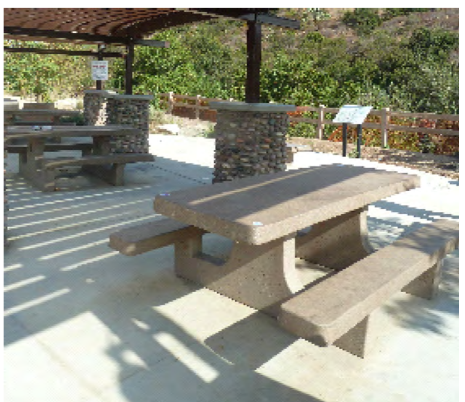
TABLES UNDER SHADE STRUCTURE