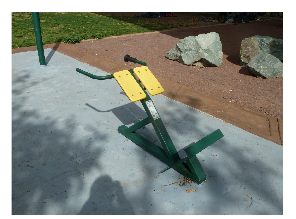
STATIC EXERCISE EQUIPMENT