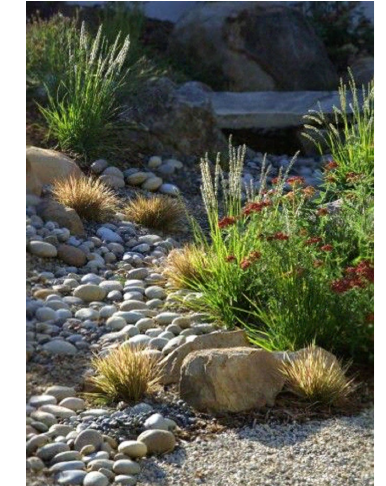
DRY CREEK BED