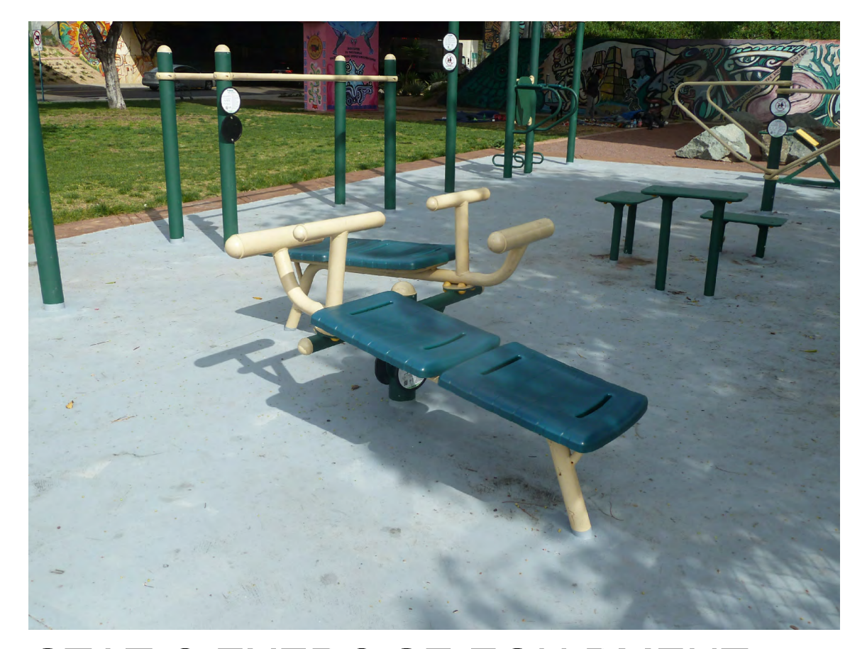
STATIC EXERCISE EQUIPMENT