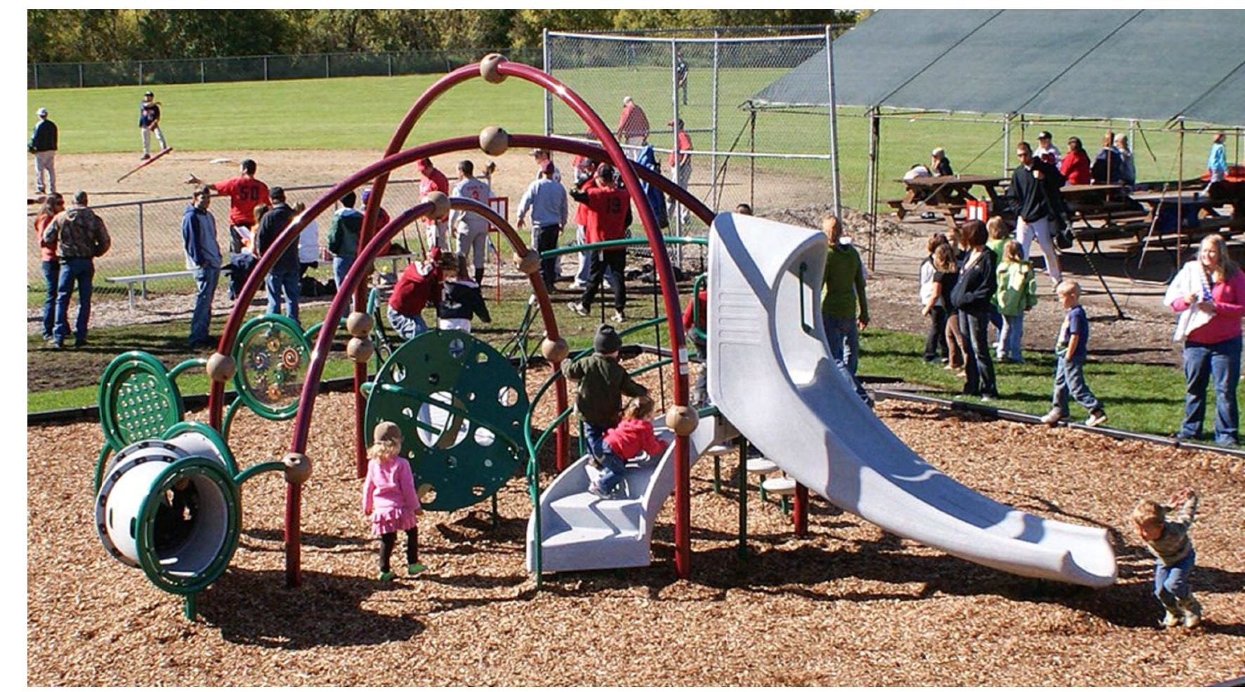
2-5 YEAR OLD PLAY EQUIPMENT