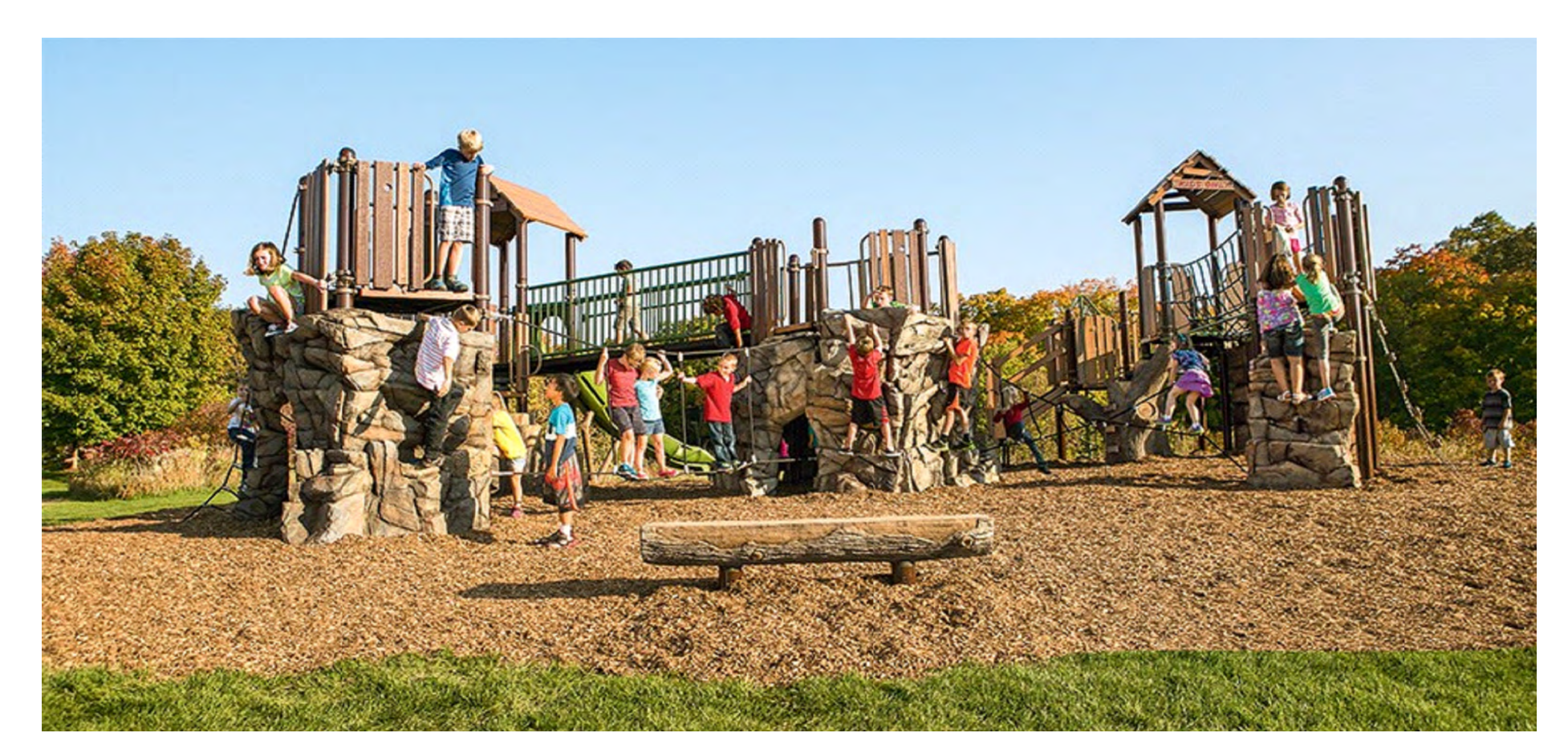
5-12 YEAR OLD PLAY EQUIPMENT