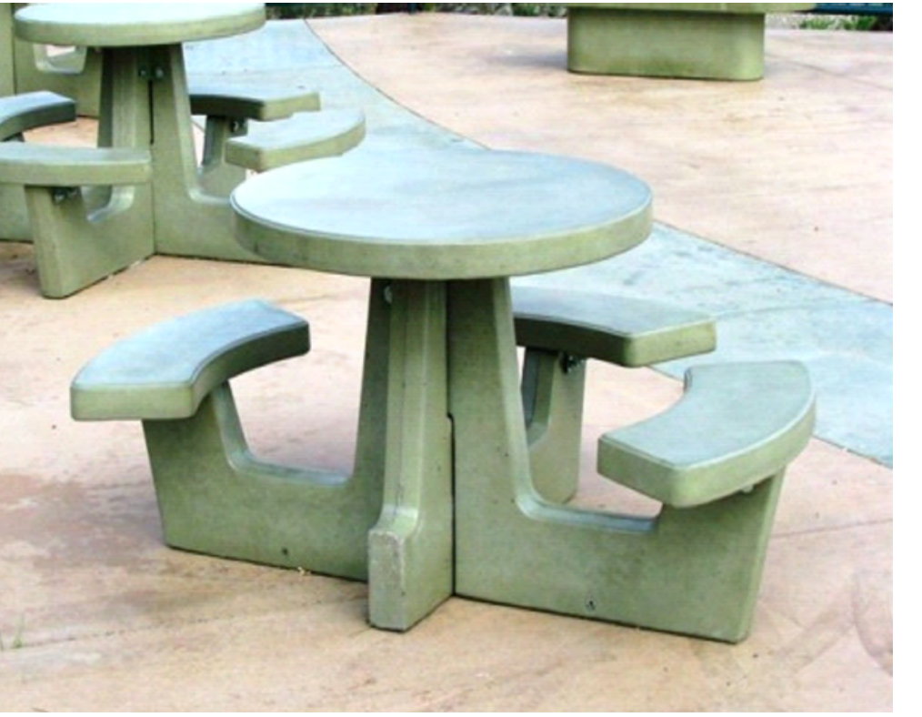
TABLES AT PLAZA