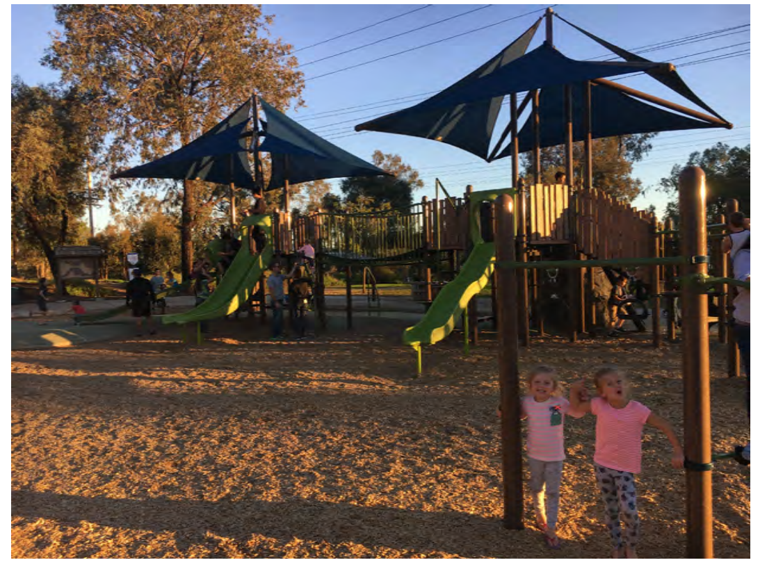
5-12 YEAR OLD PLAY EQUIPMENT