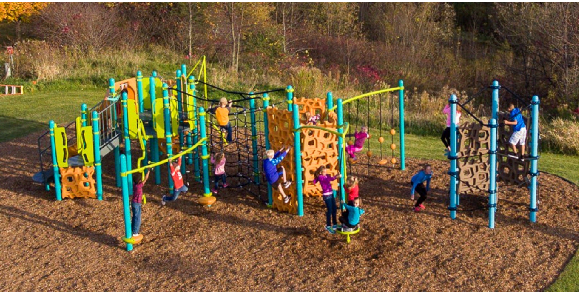
2-5 YEAR OLD PLAY EQUIPMENT