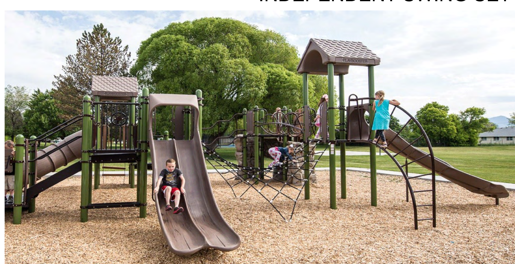
5-12 YEAR OLD PLAY EQUIPMENT